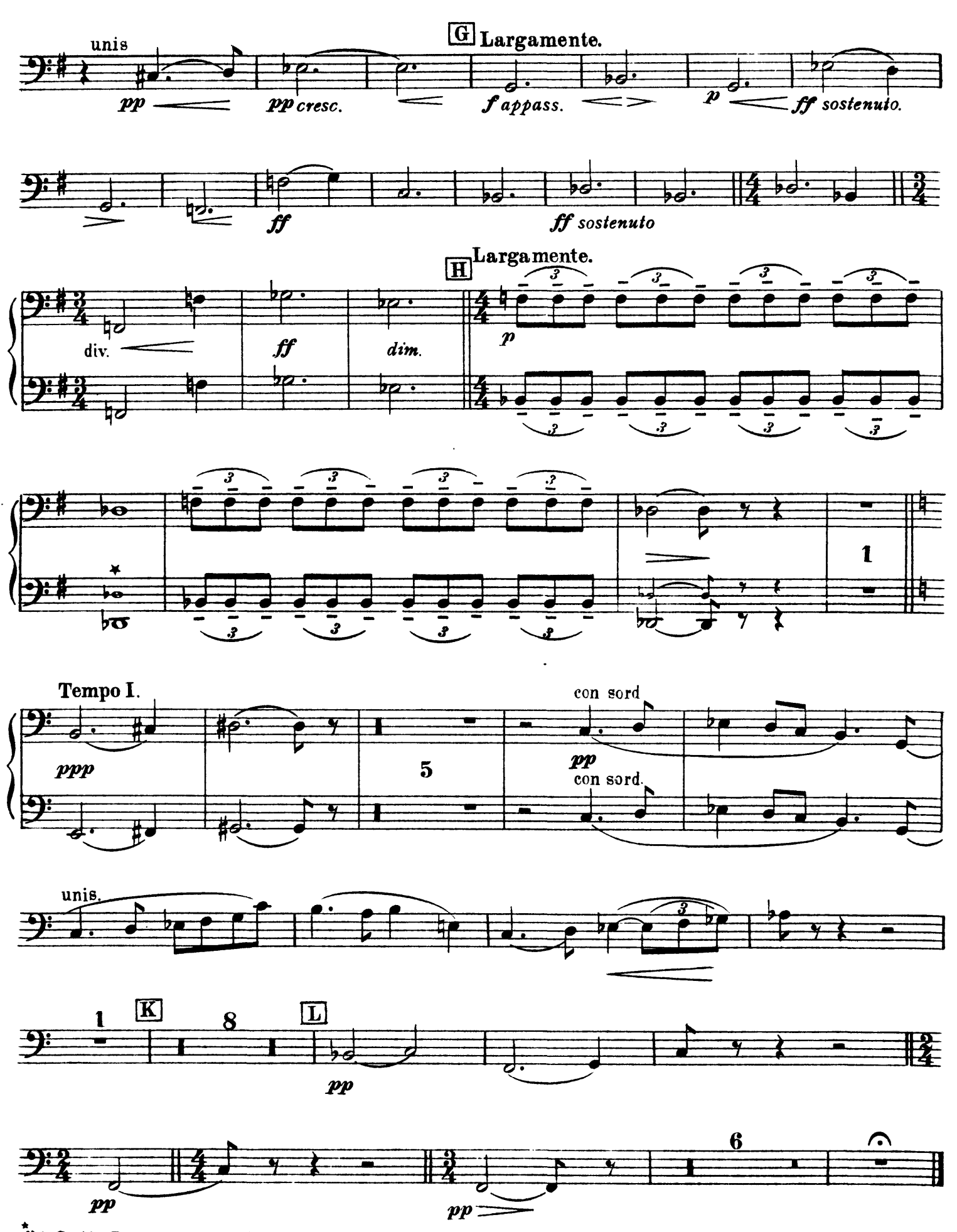
Mile Double Basses not to tune down, only those which have the low D's to play it, the rest to play the upper Dis.